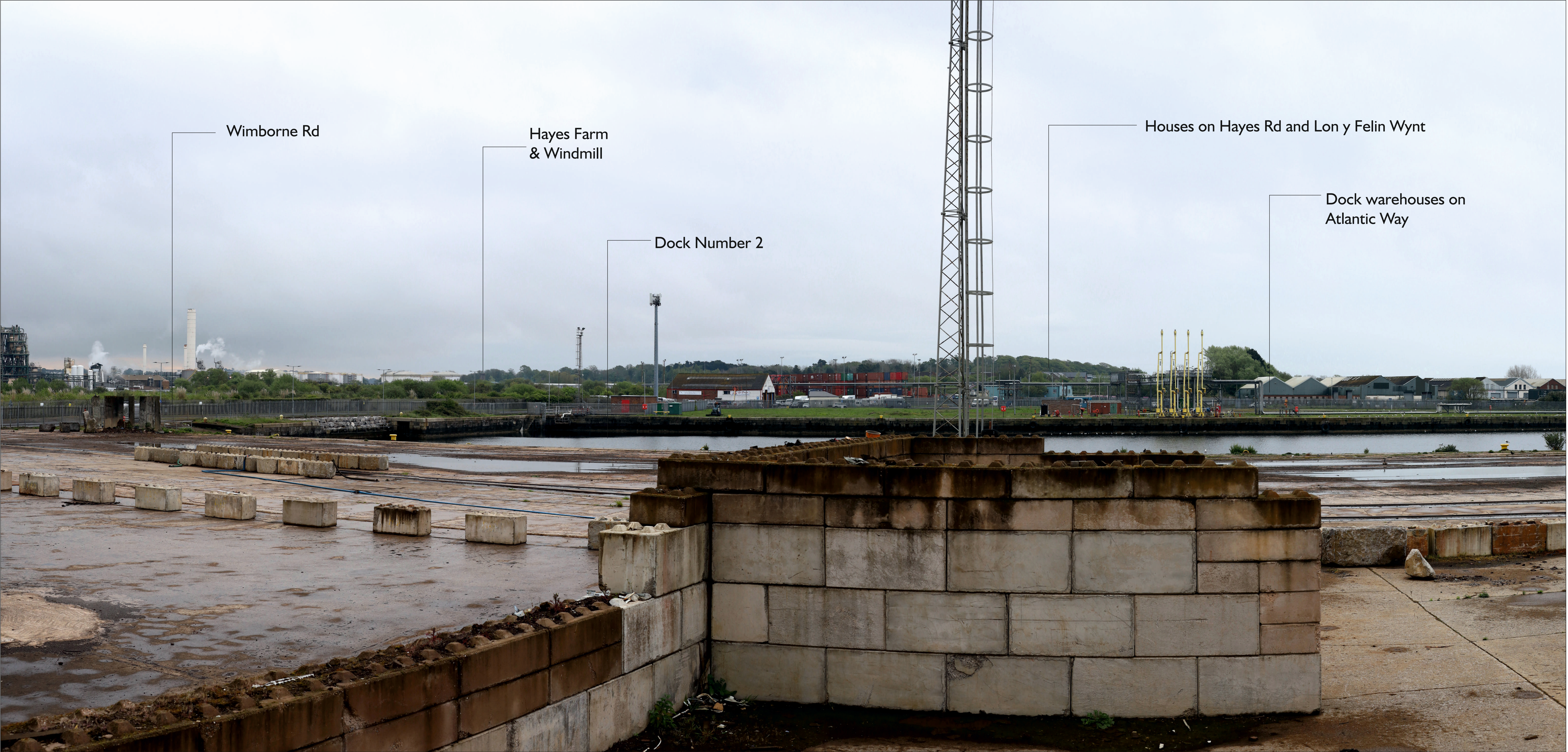
Illustrative Viewpoint 3c - Looking southeast from top of block wall located towards centre of the Site